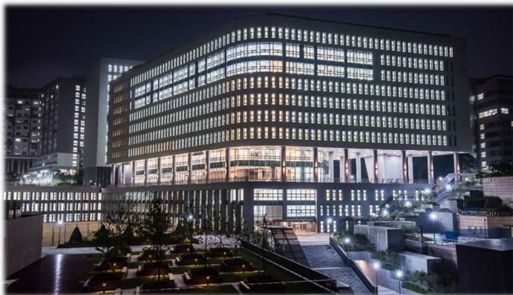
Centennial Building (Bldg. 310)