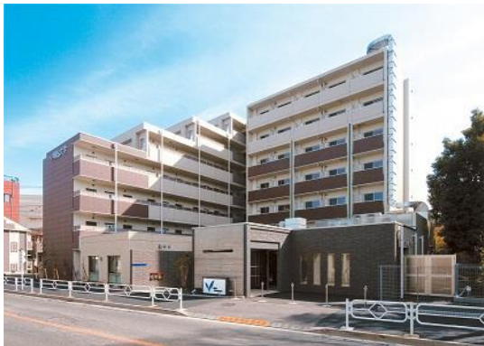
Exterior of the building 外観