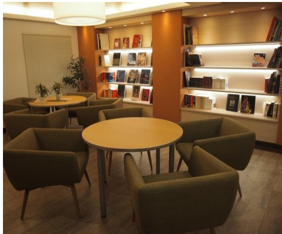
Entrance Lobby エントランスロビー