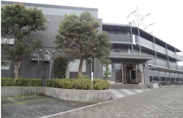
Exterior of the building 外観