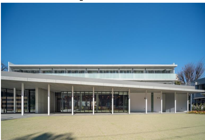
Exterior of the building 外観