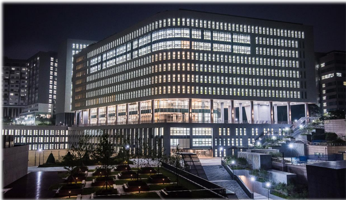
Centennial Building (Bldg. 310)